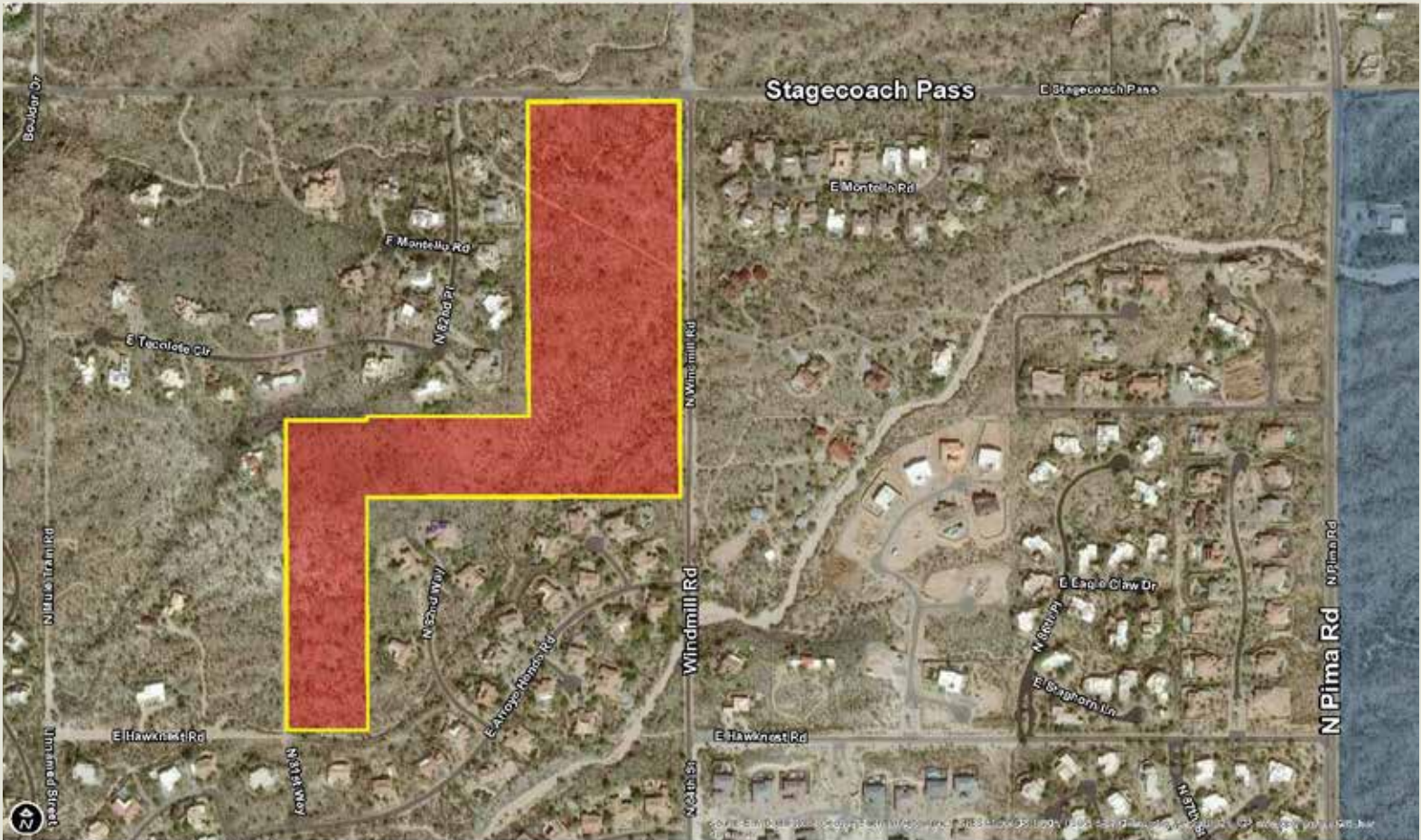
SIGNATURE AT BLACK MOUNTAIN ±37.46 ACRES | PLANNED FOR 15 CUSTOM LOTS STAGECOACH PASS & WINDMILL RD SCOTTSDALE, ARIZONA